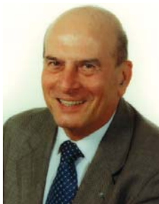
by Giancarlo Colferai

A decision to implement a QMS may be the organization's first real contact with the world of ISO 9000 – especially if it is an SME – and many turn to an external consultant for help. The ISO 9000 family will soon include guidelines for making the right choice and the best possible use of QMS consultant.